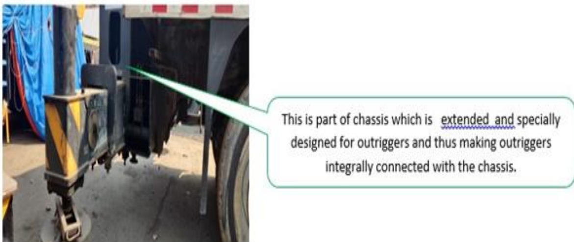
Pic-10 Crane back side right outrigger

4.1 For illustration purposes the pictures of the cranes previously imported at Mumbai Port, are reproduced below. It is clearly seen that the machine (Crane) and chassis of the vehicle are integrated, and the chassis is specially designed for the crane. This is depicted in the pictures below.