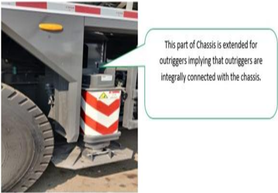
Pic-11 This picture shows the front side right outrigger of the crane.