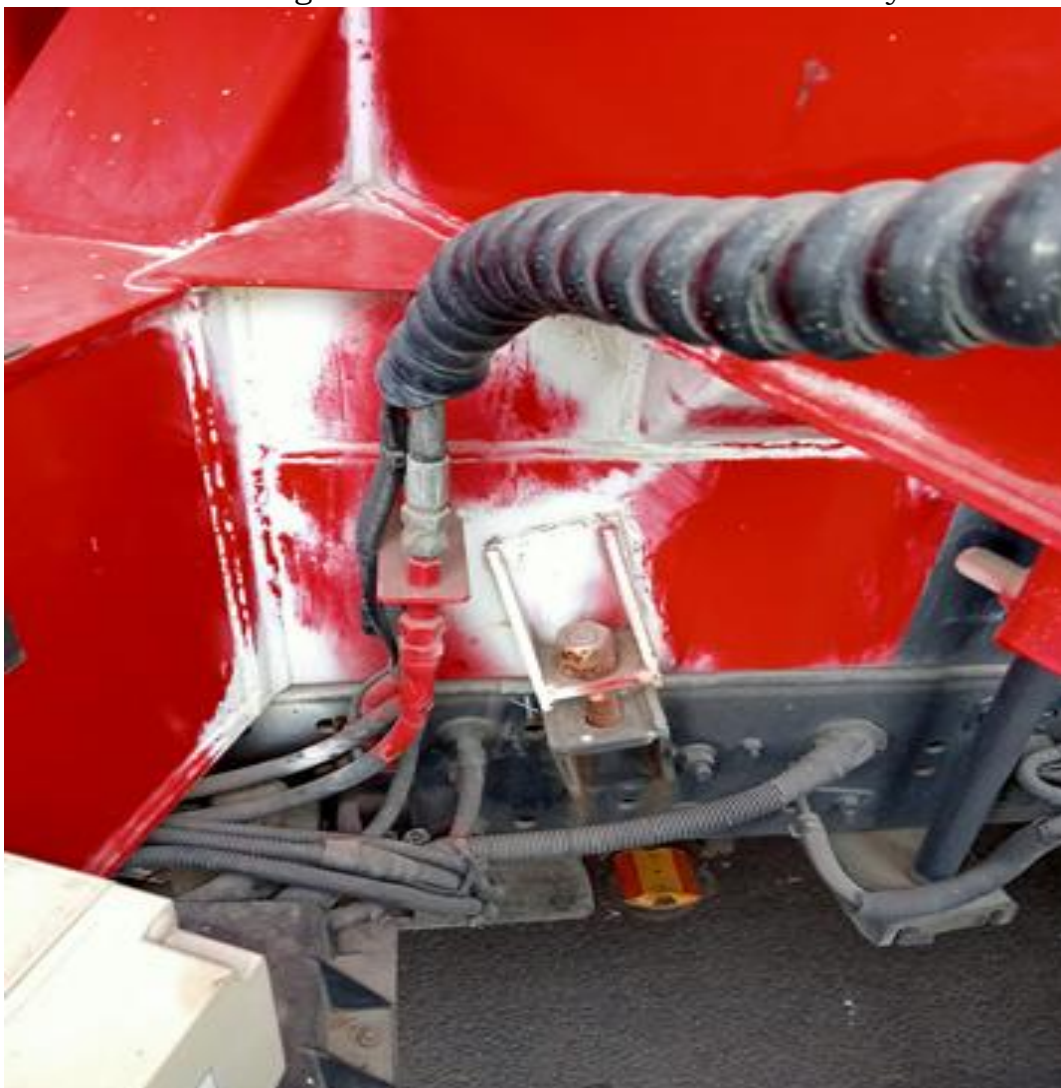
Pic-6 Bolting of Boomlift with the chassis