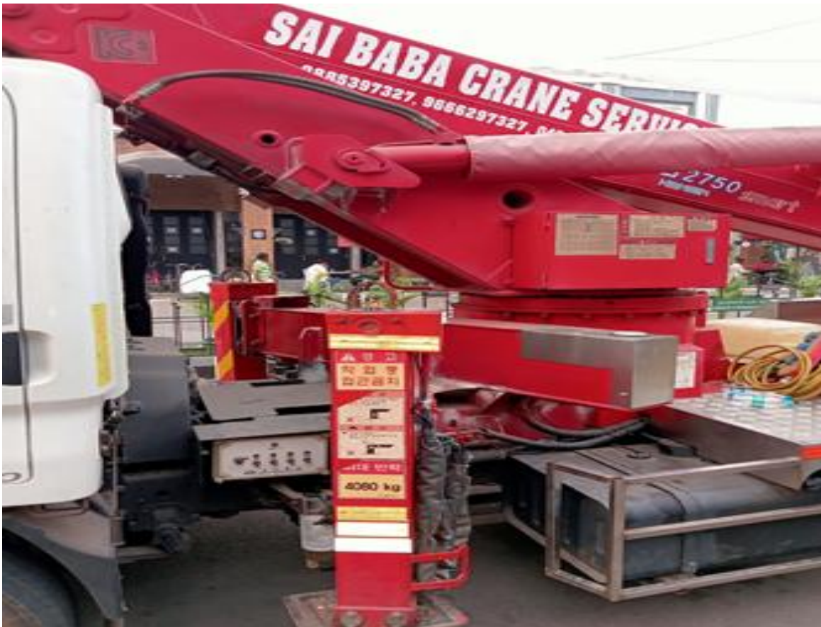
Pic-9 Front side left outrigger

3.8 Regarding point 4 & 5 of para 9 (D) of CBIC Circular No. 20/2022-Customs, it can be concluded that the chassis and Boomlift do not appear to be integrated mechanically as outlined in paras 3.9 and 3.10.