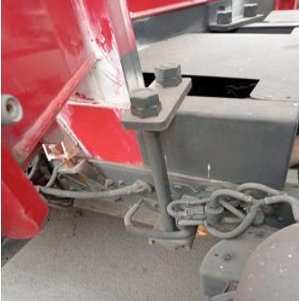
Pic-7 Bolting of the Boomlift with the back side of the chassis

3.7 Outriggers: Regarding point 3 of para 9 (D) of CBIC Circular 20/2022-Customs above, it is observed that the outriggers are attached to the supporting beam of the Boomlift only and outriggers are nowhere directly attached to chassis of the vehicle ( as shown in Pictures 8 & 9 ). The same has been confirmed by the 2 nd CE vide report dated 09.05.2023 and accepted by the importer in his statement dated 28.06.2023. Additionally, the outriggers cannot be controlled from the vehicle cabin; rather these are controlled from the separate levers provided in the Boomlift.