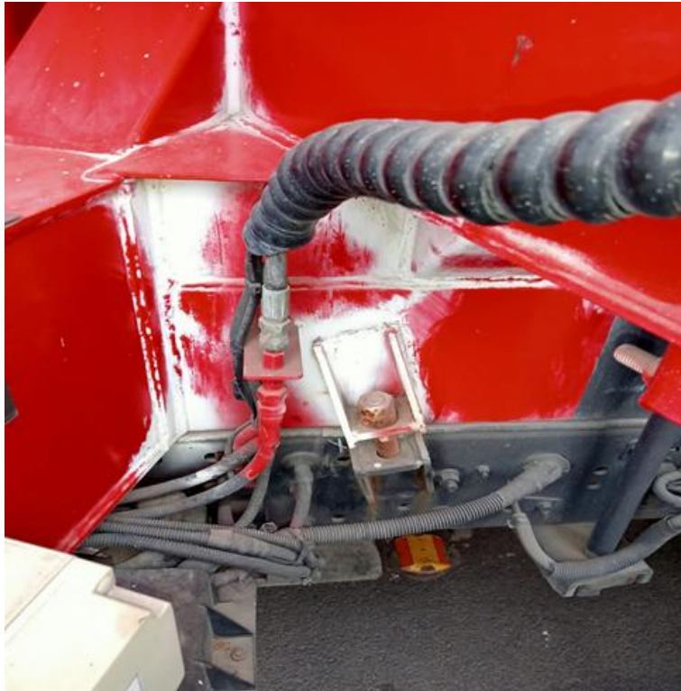
Pic-3 Boomlift HS2750 Mounted on vehilce Chassis through bolt

3.6 Chassis and machine: Regarding points 1 & 2 of para 9 (D) of CBIC Circular No.20/2022-Customs above, it is observed that the chassis and truck engine are of Company HYUNDAI. However, the Boomlift is fitted onto the chassis and is of HANSIN make and it has a supporting beam. This supporting beam of Boomlift is mounted through a nut-bolt on the chassis of the vehicle (as shown in Pictures 3 to 7). Therefore, it can be said that if the Boomlift is dismounted from the chassis of the vehicle, then the chassis can be used for some other purpose also and therefore chassis is not specifically designed for the Boomlift.