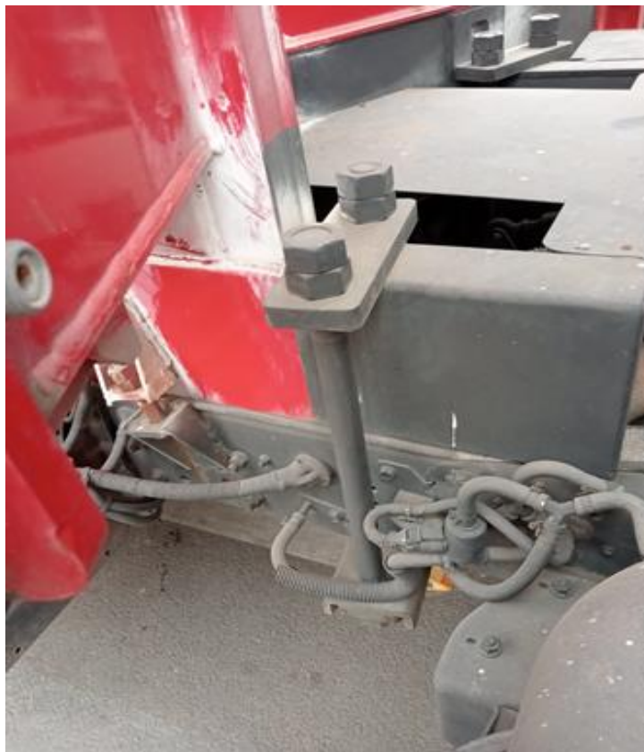
Pic-4 Bolting of chassis of vehicle and beam of Boomlift just behind the vehicle cabin from the upper right side