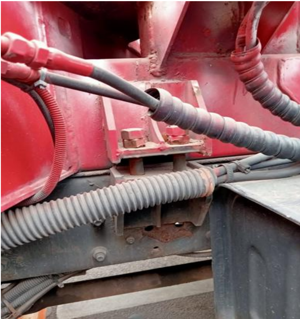
Pic-5 Bolting of chassis of vehicle and beam of Sky lift